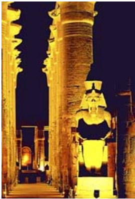
Luxor Temple at Night